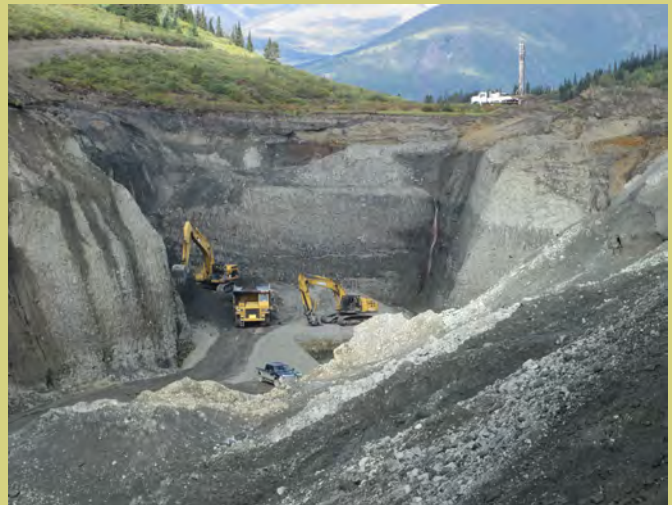
Before and after photos of a placer mine site near Atlin, B.C.